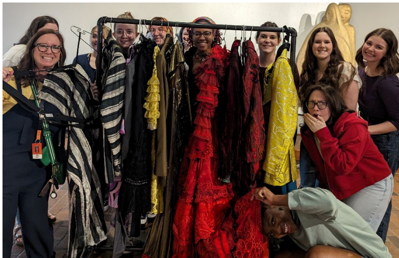
Spotlight participants enjoy a workshop with the Wardrobe Supervisor from the Broadway tour of Beetlejuice .